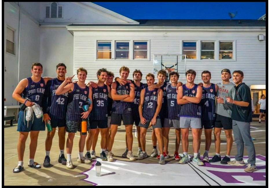
FIJI's GBA championship squad posing together for a victory photo at the Delts house.

This past fall our Phi Gamma Delta basketball team brought home the gold in the Greek Basketball Association with an electric buzzer beater. For those who don't know the Greek Basketball Association (GBA) is a basketball league created solely for fraternities to participate in. The season lasts a total of two months with two games per week. Each game is played at a fraternity house's outdoor court with two refs provided by each opposing team. Despite the disadvantage of always playing at opposing teams' courts, our FIJI squad managed to rank 5th by the end of the regular season, securing their spot in the playoffs.