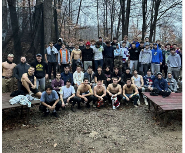
Zeta Fiji Brothers laughing after a day of paintball. This would not have been possible without Explore Brown County.

This past fall also included a wonderful brotherhood paintballing event. Over 70 brothers made their way to the forests of Brown County to play paintball and bond as a house.