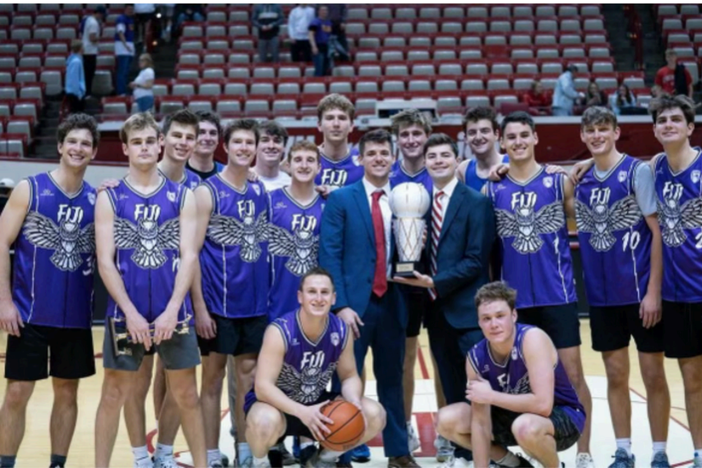
The GBA team hoisting the trophy after defeating the Purdue FIJI team in the GBA championship in Assembly Hall. The Zeta Gams won 61-47.

The winner of that game got to move on and play in Assembly Hall against Purdue's own GBA winner. Our FIJI squad, which consisted heavily of seniors, four juniors, and three sophomores, surpassed SAE, allowing them to play against Purdue FIJI in Simon Skjodt Assembly Hall for the first-ever Greek IU vs. Purdue showdown.