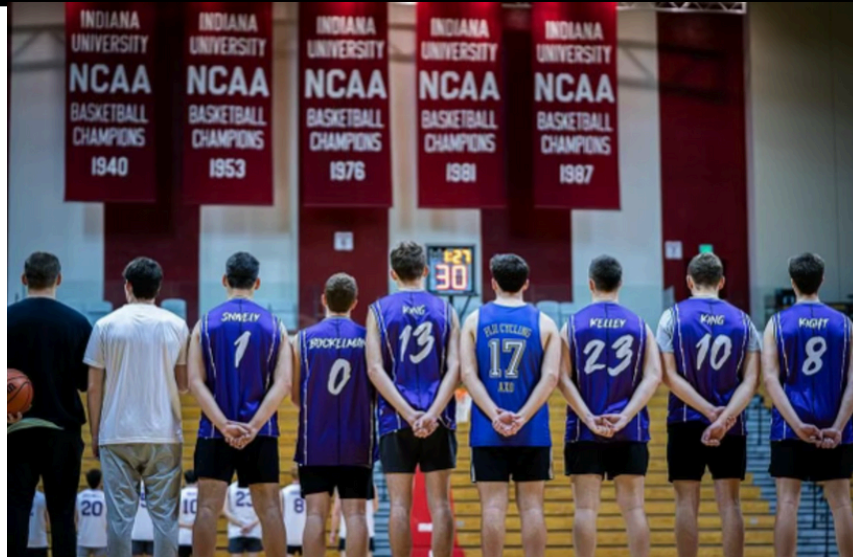
FIJI's GBA squad standing for the National Anthem before the GBA Championship in Assembly Hall.

This past fall our Phi Gamma Delta basketball team brought home the GBA championship. For those who don't know the Greek Basketball Association (GBA) is not a part of Intramurals, but a separate league created solely for fraternity play. The season lasts a total of two months with two games per week. Each game is played at a fraternity house's outdoor court with two refs provided by each opposing team. Despite the disadvantage of only playing at opposing teams' courts, our FIJI squad managed to rank fourth on campus by the end of the season. The tournament consisted of three rounds. In the first round, we played Pi Kappas, the second Sig Ep, and lastly SAE in the Indiana University GBA Championship.